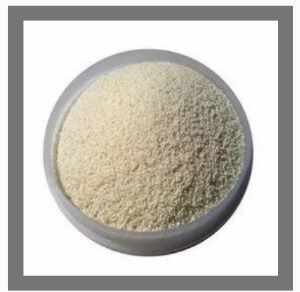
Organic Wheat Rava