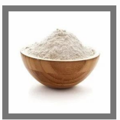
High Fiber Digestive Wheat Flour