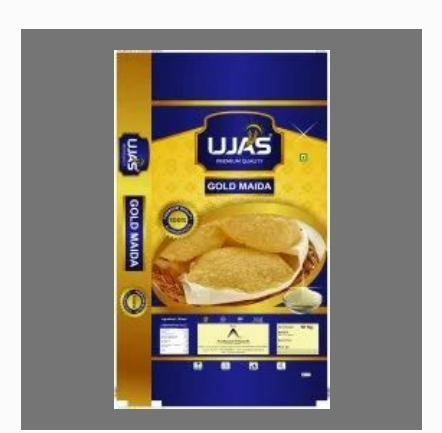
50 Kg Ujas Gold Maida