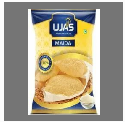
500gm Ujas Maida