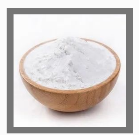
Tandoori Wheat Flour