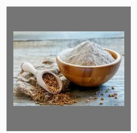
10 Kg Pure Wheat Flour