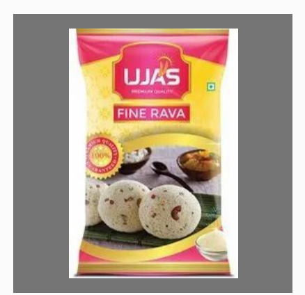
Fine Wheat Rava