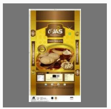
25kg Chakki Fresh Atta