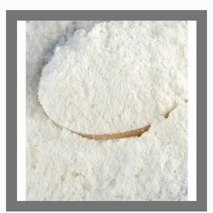
Wheat Fine Flour Maida