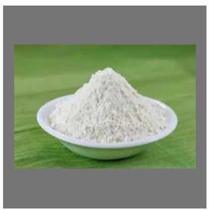
Super Fine Maida