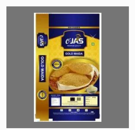
Ujas Gold Maida