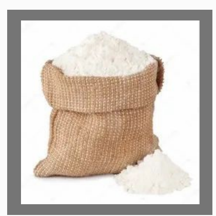
25 Kg Tandoori Wheat Flour